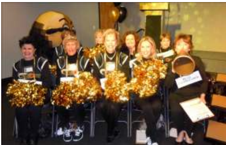
Me, with fellow cheerleaders at ASTEC's 10th anniversary event.